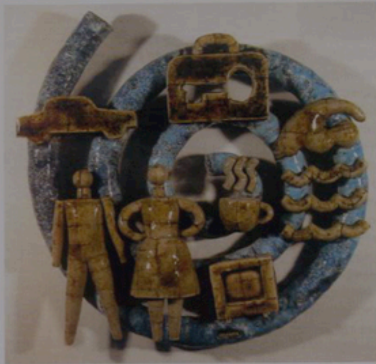
Martin Hearne - Coil , ceramic relief, earthenware, H45cm. Contemporary Crafts at Kenwood , Kenwood House, Hampstead, London, May 13 - June 13.