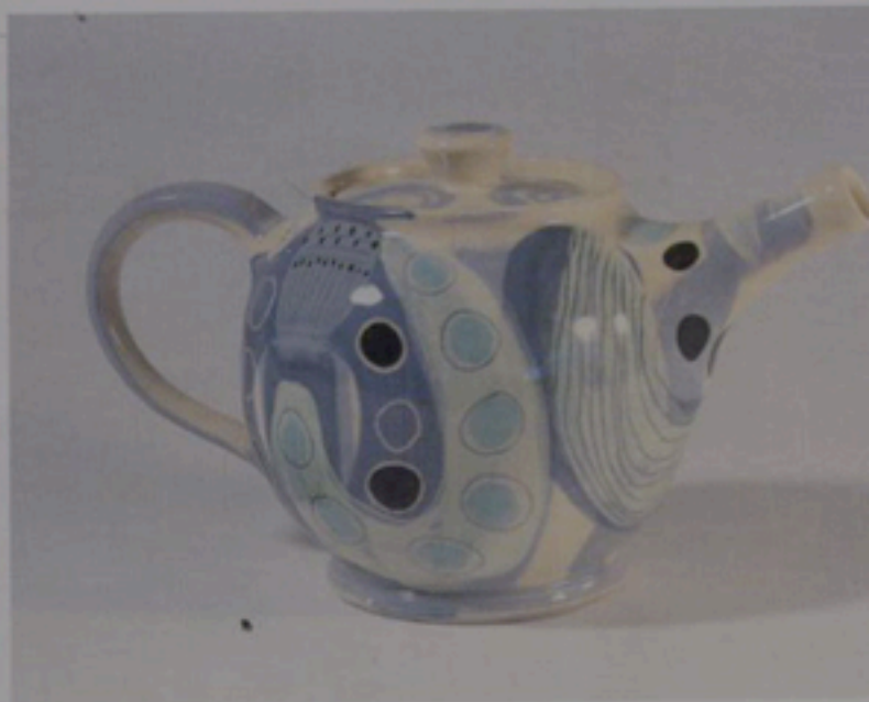
RAMP (Roop and Al Make Pots) - Teapot, thrown earthenware, with slip and underglaze decoration, 2003, H16cm. Talisman , Gillingham, Dorset, July 3-4 and Cockpit Arts Open Studios, Deptford, London, June 4-6.