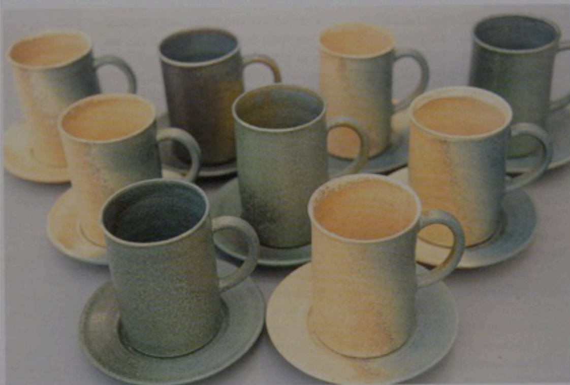
RIGHT: Fran Tristram - Coffee cups and saucers, single fired stoneware, H8cm. Lady Bay Open Studios , Lady Bay Pottery, Nottingham, May 15-16.